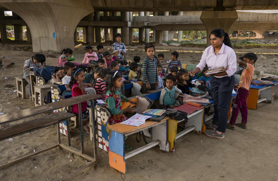
Photographer: Mrinal Sen